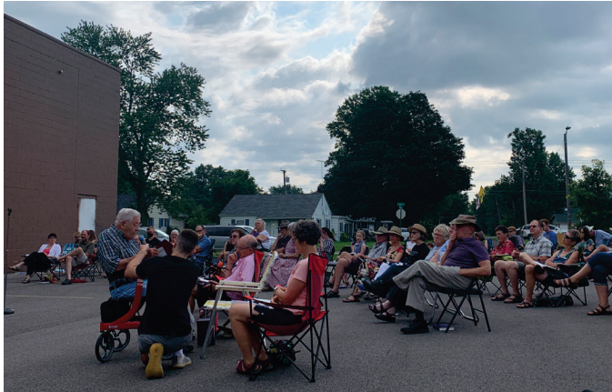
Members of Assembly Mennonite Church in Goshen, Ind. worshipped in the church parking lot during the pandemic.

Stories and News from Around the Conference