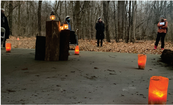
Members of Assembly celebrated Advent at Witmer Woods on Sunday evenings during the pandemic.