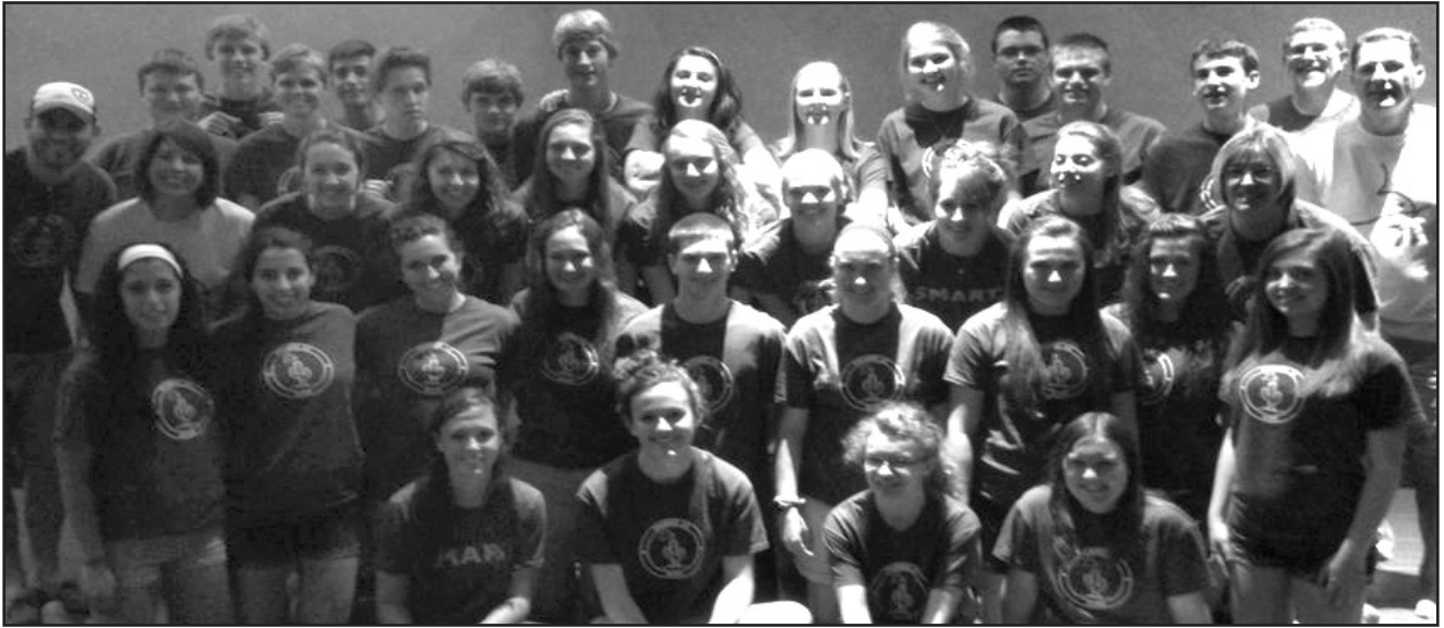
Silverwood and Emmaus Road youth together attended MC USA convention in Phoenix.