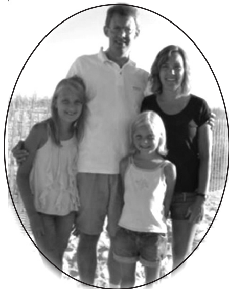
The Nolt family

Note: This article was written when the Nolts were members at Eighth Street Mennonite. Rachel is now one of the pastors at Silverwood.