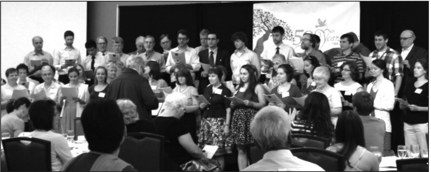
First, Champaign-Urbana's Jubilee worship choir