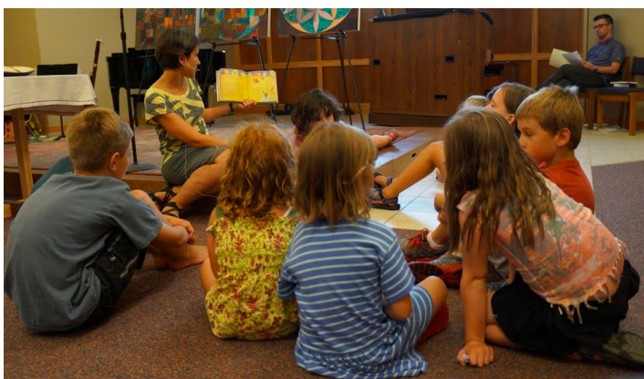
Children's time during worship during 2014's annual meeting.