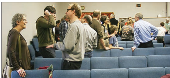
Members of the Milwaukee and Madison, Wisc., congregations enjoyed fellowship time at their gathering on April 30.