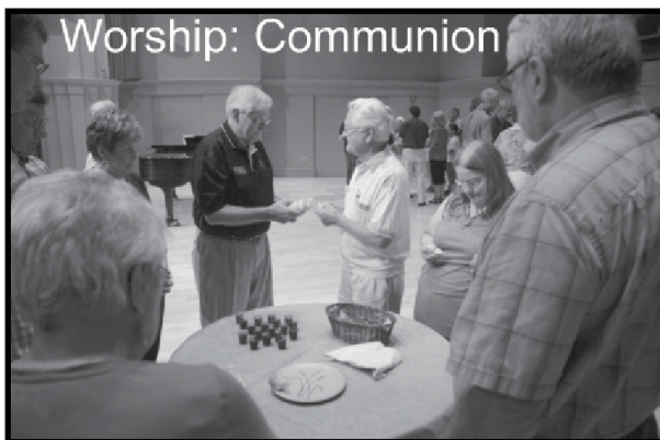
Communion is offered during a worship session at the 2013 Central District Conference Annual Meeting in Bluffton, Ohio.

2014 CDC Annual Meeting June 26-28 Madison, Wisconsin