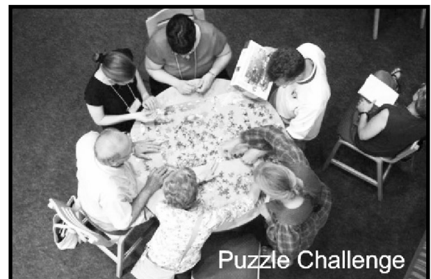
During the 2013 Central District Conference Annual Meeting in Bluffton, Ohio. 3