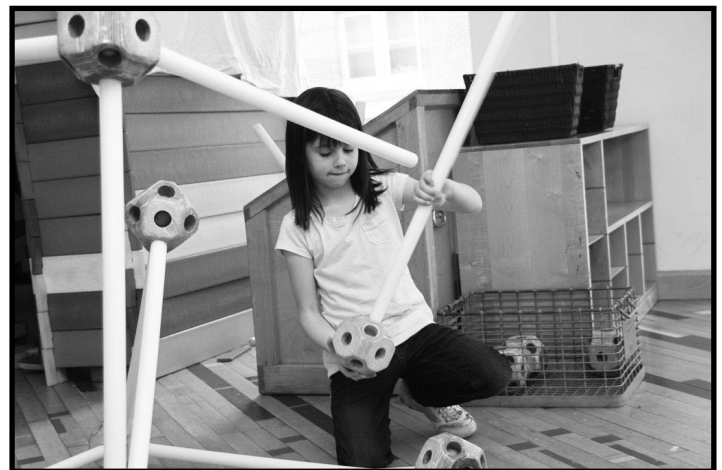
Fun at the Madison Children's Museum.