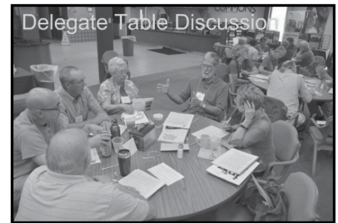
Delegates discuss at the 2013 Central District Conference Annual Meeting in Bluffton, Ohio.

Delegates and others can find copies of the resolutions, membership status requests and various other reports on the CDC's website.