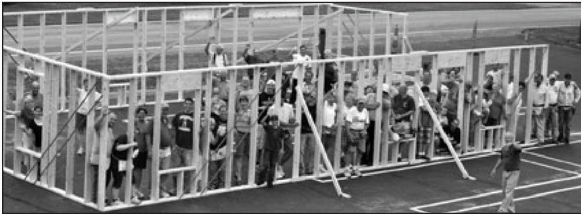
Oak Grove congregation works on the Habitat house