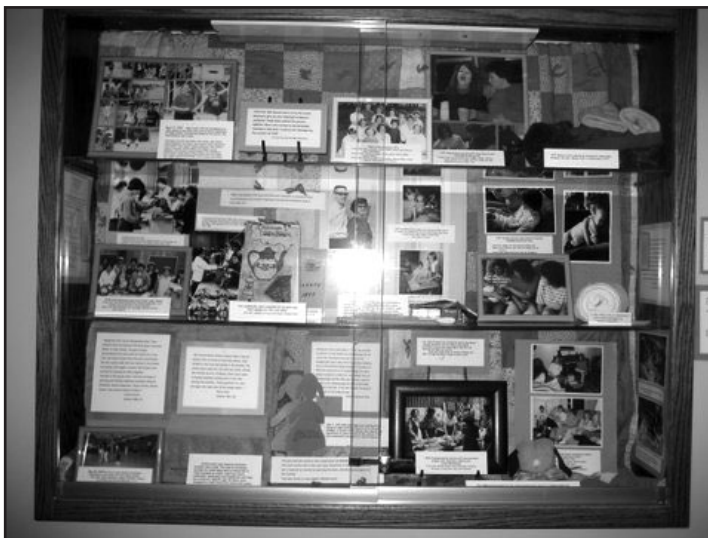
Salem's historical exhibit

The book is published by AuthorHouse, Bloomington, Ind. ISBN: 9781468588514.