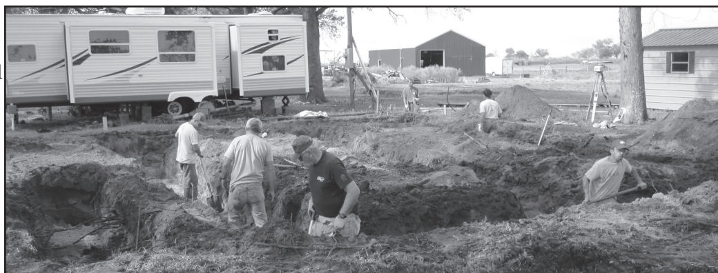
Silverwood members "working in the trenches" at Cameron